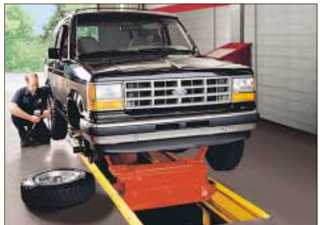
Power Jack Kit for Quick Lube Type Pits

Keeps both hands clear during lifting or lowering. Automatic system locks the jack at any of three heights. Locks are completely independent of the air system to assure maximum safety.